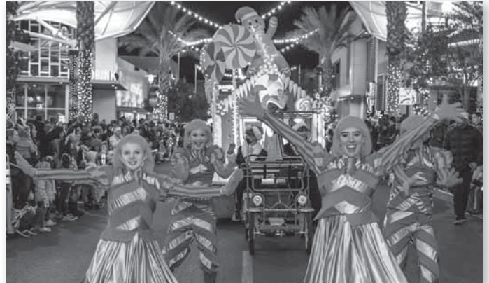
Downtown Summerlin is your holiday headquarters! The annual holiday parade kicks off November 22!

Returning to Downtown Summerlin is The Giving Machine that will open November 15 through year-end. Organized by the Church of Jesus Christ of Latter-day Saints, The Giving Machine gives visitors an opportunity to make a holiday donation at a giant vending machine to one of several local nonprofits and international charitable initiatives. This year's local beneficiary organizations include Catholic Charities, Three Square, Helping Hands of Vegas Valley, Foster Kinship, and Spread the Word.