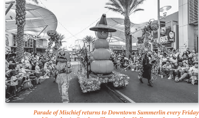
Parade of Mischief returns to Downtown Summerlin every Friday and Saturday in October. The popular Halloween-themed parade is one of several fall-themed events in Summerlin.

The family-friendly Parade of Mischief , presented by Tempo Solar, will fill the streets of Downtown Summerlin with mischievous mayhem every Friday and Saturday night in October at 6 p.m.: October 4, 5, 11, 12, 18, 19, 25 and 26. The event is free and open to the public and takes place along Park Centre Drive in the heart of the popular shopping, dining and entertainment destination. This year, Parade of Mischief includes aliens, Cruella de Vil and Hocus Pocus witches, a Día de los Muertos float, a fully revamped Addams Family float, and more. Parade-goers can opt in to receive messages via the Downtown Summerlin app to receive SMS messages throughout the season for exclusive giveaways. More than 60 local youth have been cast in various roles. Information on Parade of Mischief at Summerlin.com.