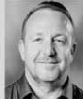
Art of Insurance www.artofins.com

Not Affiliated With or Endorsed By Any Government Agency