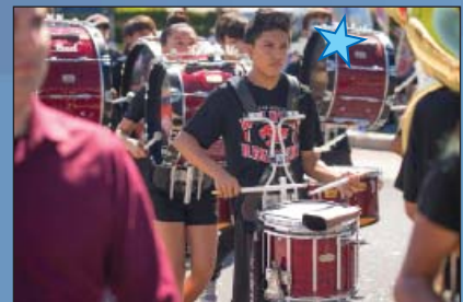
BANDS & PERFORMING GROUPS